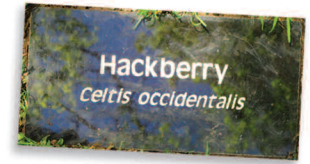
Hackberry Celtis occidentalis

The Sweetwater Arboretum is open from dawn 'til dusk every day of the year. Take a casual stroll or a brisk walk along the paved path and you'll find stone markers at the base of many trees to identify their species. In every season, there's a special beauty: flowering trees of springtime, lush greenery of summer, spectacular colors of fall foliage, stately winter silhouettes.