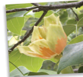
Tulip Poplar flower

Leashed dogs are welcome and a dog station is provided to help you keep the park clean and enjoyable for all.