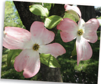
Pink Flowering Dogwood

Residents and visitors are invited to explore this serene natural oasis and observe a wide diversity of Tennessee trees in a relatively compact area. The Arboretum is a resource for field trips and outdoor classes, as well as a