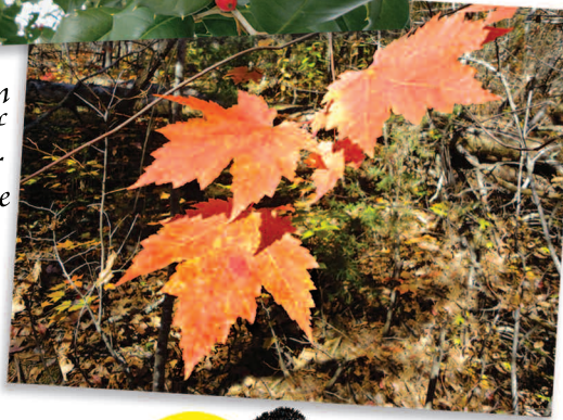
Autumn foliage of Sugar Maple