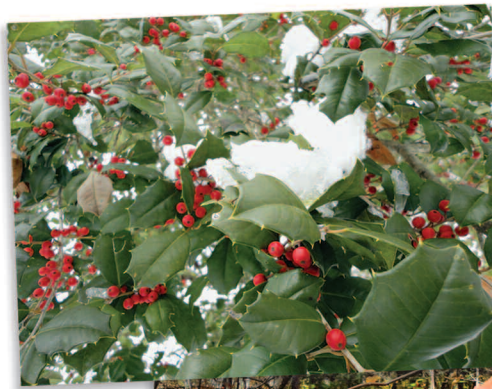
American Holly with winter berries